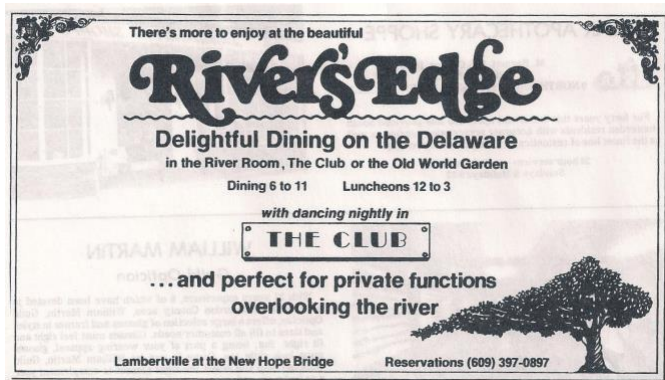
Ad from "Welcome to South Hunterdon" a 1973 publication of the South Hunterdon Chamber of Commerce.