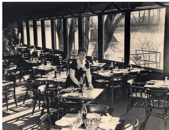
The dining room had a stunning view of the river and bridge as seen above with "Stella Dallas."

Unfortunately, Walsh's tenure was relatively short. The restaurant suffered a disastrous fire shortly before Thanksgiving 1975 forcing many with sold out holiday reservations to abruptly change plans, and worse, leaving more than 100 employees without jobs. Despite his intention to rebuild, Walsh ran into obstacles for several years and eventually sold the property. The River's Edge townhouses were built on the site in the mid-1980s. Both the restaurant and the current homes incorporated some walls of the mill originally located there. The 1912 Sanborn insurance map indicates it as the Joseph G. Lear Flour Mill.