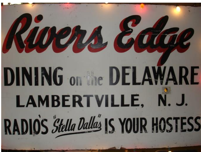
This sign promoting River's Edge may currently be seen at the Stoneking Physical Therapy and Wellness Center on Cherry Street.